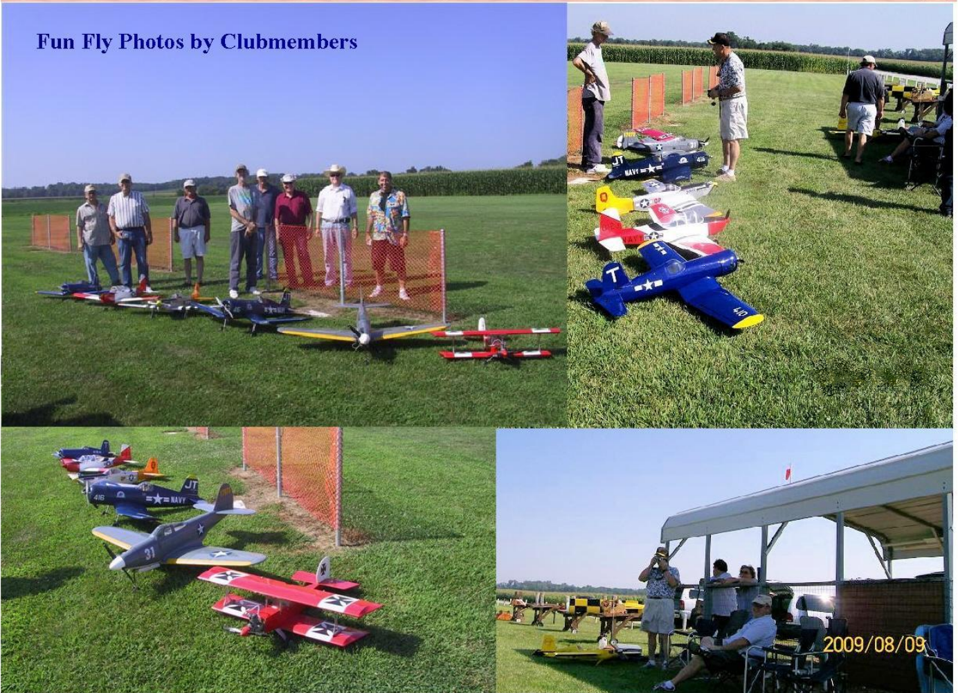
Fun Fly